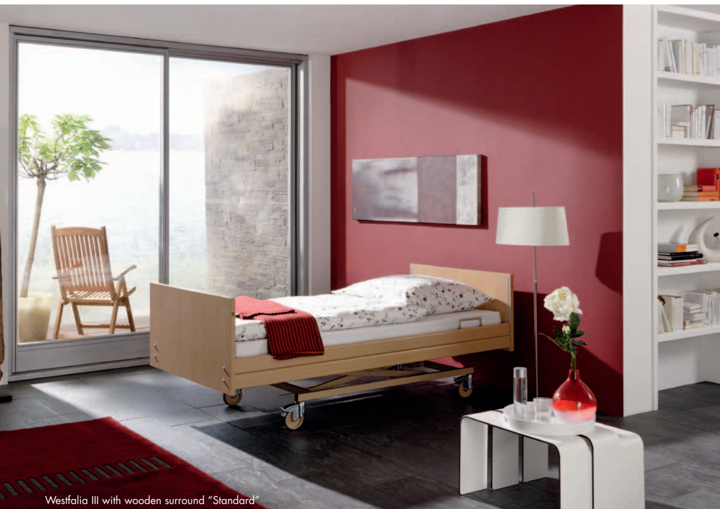
Westfalia III with wooden surround "Standard"