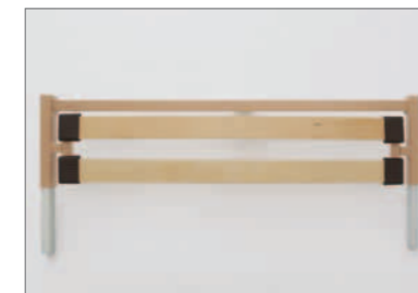
bed extension with wooden slats (4 longer wooden side rails 220 cm) (also for retrofitting)