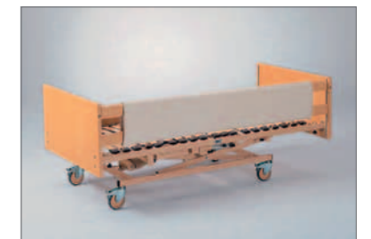
padded side rail cover