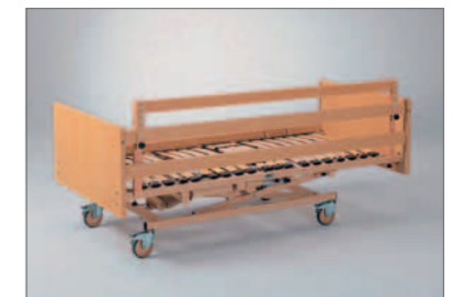
clamp-on extra-high side rail