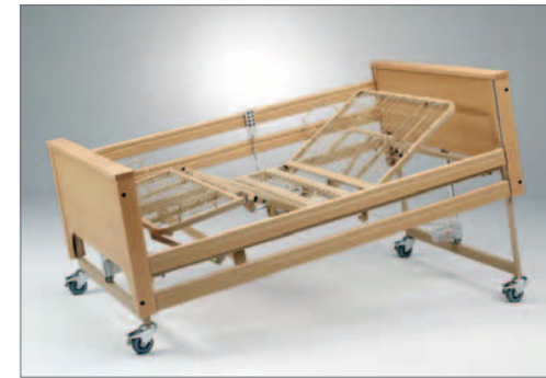
lowered foot section

clearance with all commercially available lifters