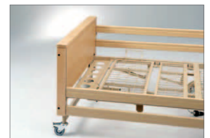
integrated bed extension including 4 longer wooden side rails 220 cm (also for retrofitting)