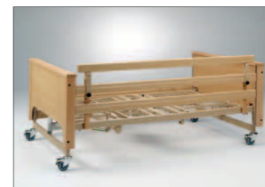
clamp-on extra-high side rail