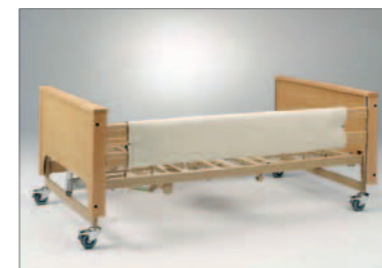
padded side rail cover