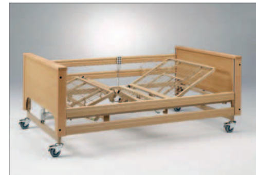
lower leg rest liftable by ratchet